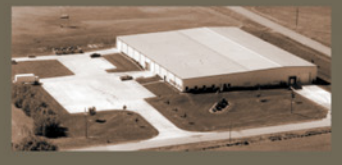
Huyett Plant 2002

G.L. Huyett was founded in Minneapolis, Kansas in 1899 by Guy L. Huyett, a German immigrant. The business was incorporated in 1906, and is now one of the oldest continuously operating businesses in the state.